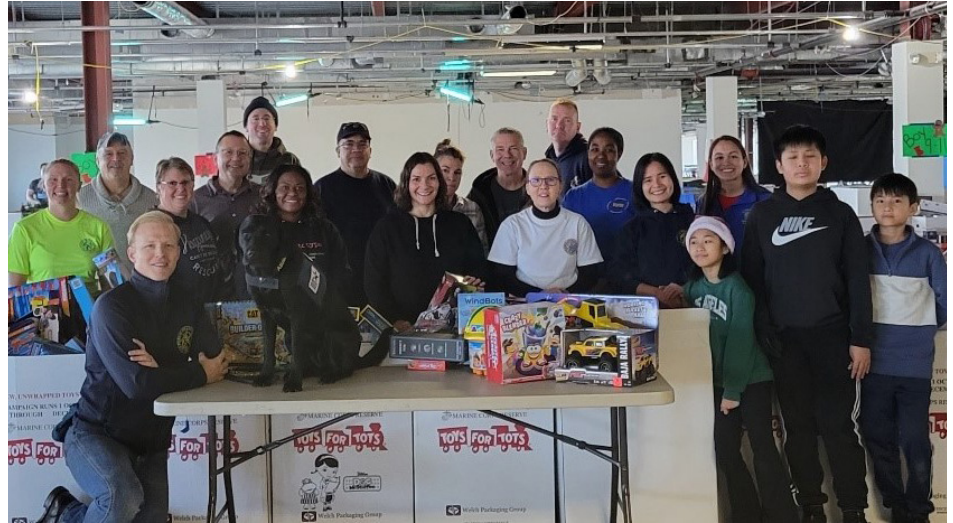
Officers from DC COA participated in the toy sorting activity for the Marine Corps Toys for Tots Drive on December 12, 2023.