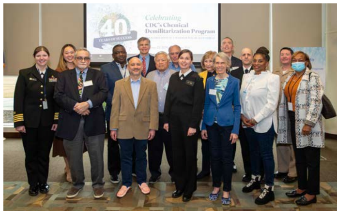
A group of USPHS Commissioned Corps Officers and civil servants who worked with CDC on the demilitarization activities through the years gathered on 1/23/2024 to celebrate the complete destruction of the US Chemical Weapons stockpile and 40 years of success in the Chemical Weapons Elimination program.

Commissioned Corps Officers of the USPHS assigned in the CDC's Chemical Demilitarization Program